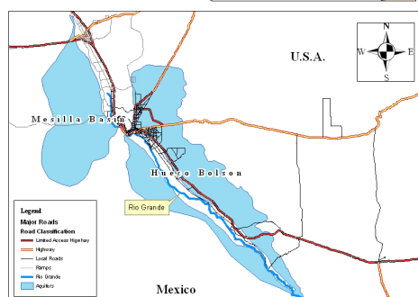
Illustration of Mesilla Basin and Hueco Bolson Aquifers in United States-Mexico boundary