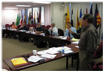
Scientific information exchange and binational meetings