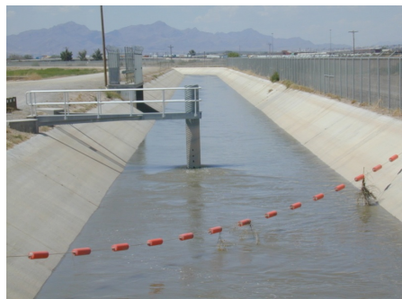
Lined American Canal Extension in El Paso

This research evaluated the applicability, water savings potential, implementation feasibility and cost effectiveness of seventeen irrigated agriculture water conservation practices in Far West Texas during both drought and full water supply conditions. Factors considered in evaluating conservation strategies included water sources, use, water quality, cropping patterns, current irrigation practices, delivery systems, technological alternatives, market conditions and operational constraints. The study examined potential water savings in over 90% of the irrigated agricultural acreage in Far West Texas.