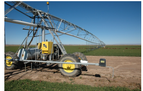
Low pressure linear sprinkler system

water recovery systems provide very small potential for economic and efficient additional water conservation.